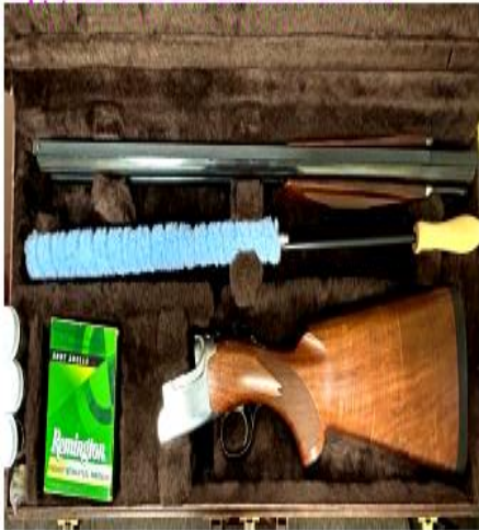
Strum, Ruger & Co Inc. 12 Ga, 3" Chambers Red Label O/U with case

To pay by credit card call Zelzah Shrine Office at 702-382-5554