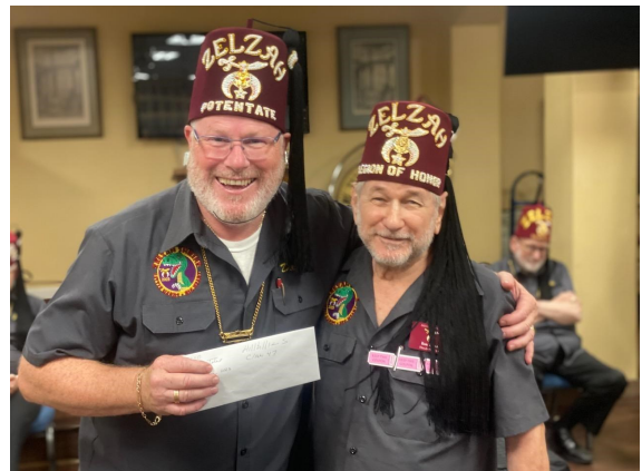
Zelzah News - October 2023