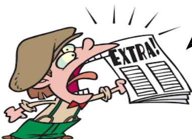
Zelzah News - May 2024