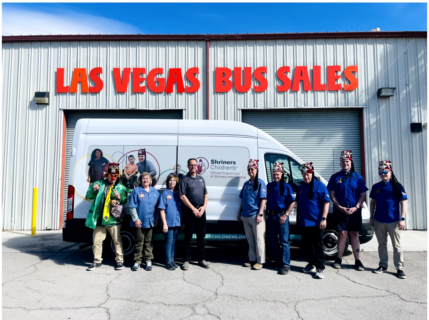
Zelzah Shriners New Hospital Patients Transportation Van