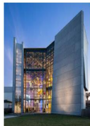
World War II National Museum

FOR MORE INFORMATION AND TO SIGN UP, TAKE A PHOTO OF THIS QR CODE