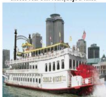
The Creole Queen Paddlewheel Dinner & Jazz Cruise

MANY OPTIONAL TOURS AVAILABLE Choose Your Own Tours, Days & Times