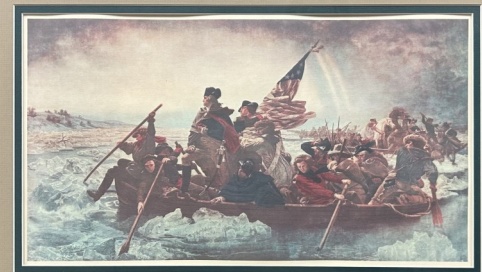
Benedict Lowie WASHINGTON CROSSING THE DELAWARE The Metropolitan Museum of Art, New York

Artwork will be available for viewing at the shrine office.