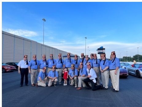
Zelzah News - August 2023