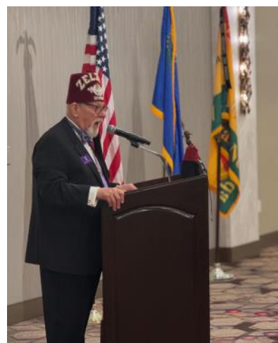
Zelzah News - April 2025