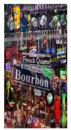
You Cannot Go To Nawlins' Without Strolling Down Bourbon Street