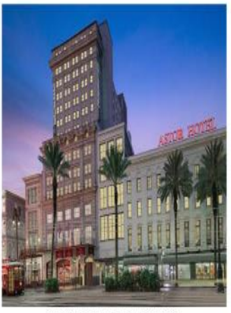
STAY AT THE BEAUTIFUL ASTOR CROWNE PLAZA HOTEL Just Two Minutes From Bourbon Street Free Wi Fi Throughout The Hotel ONLY $129.00 + Tax Per Room Per Night