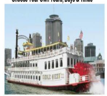
The Creole Queen Paddlewheel Dinner & Jazz Cruise