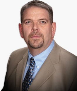
The "Golden Rule" Realtor

I Will Sell Your Home For The Most The Market Will Bear, Get your Money In The Least Amount Of Time With Minimal Hassle!