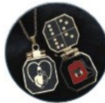
The dots on the necklace spell out LOVE in Braille.

Thank you for helping improve the lives of children.